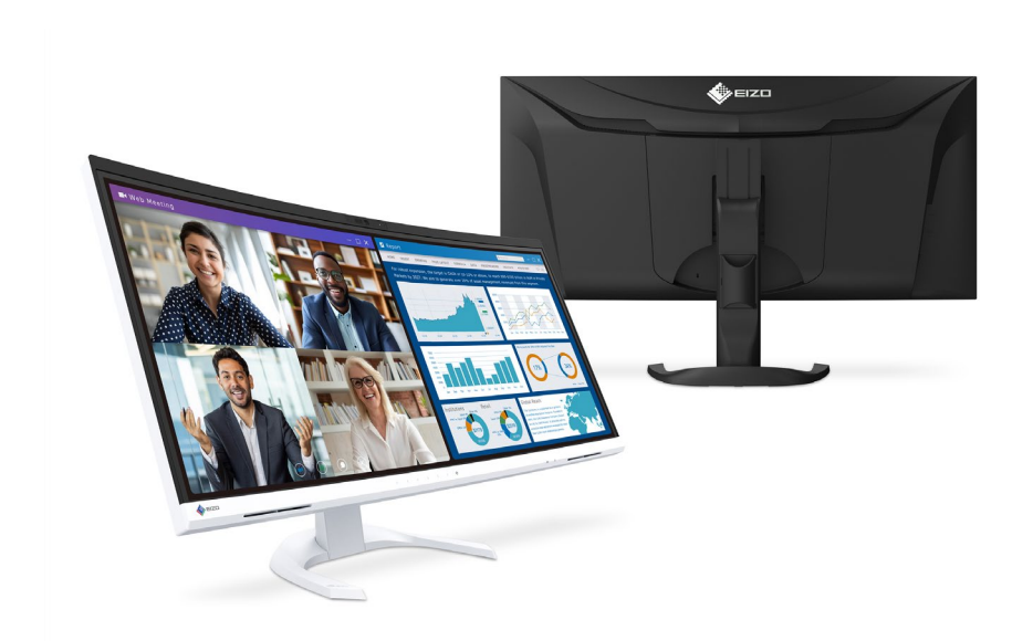
The 34.1-inch EV3450XC is EIZO's first monitor with a built-in webcam and microphone. Combined with USB Type-C docking and LAN capabilities, this ultrawide UWQHD (3440 x 1440) curved monitor offers streamlined viewing and communication for the modern business professional.